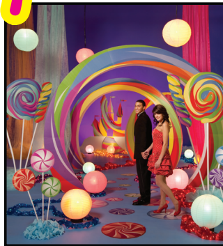
12A0 Sweet Dreams Theme