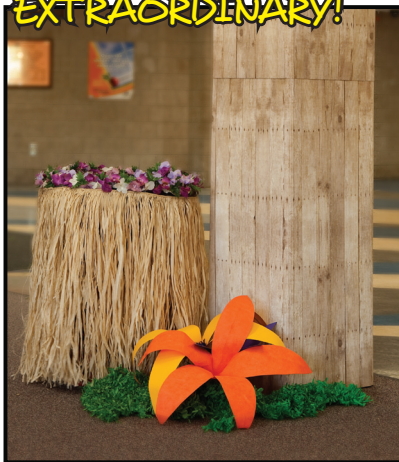
Disguise trash receptables and ordinary columns with simple solutions like a raffia table skirt, patterned paper, and theme kit components.