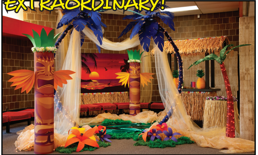
Fill up your school's foyer, atrium or entryway with any of our theme kits ( Tropical Getaway theme shown)!