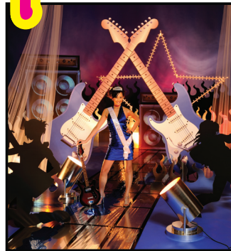
AG010C Rock-n-Roll All Night Theme