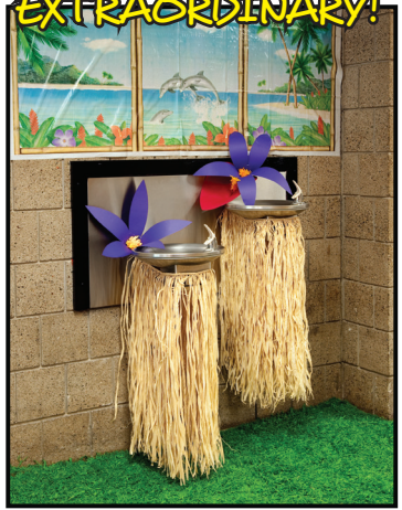
Dress up drinking fountains with raffia table skirts, theme kit components, faux grass and more.