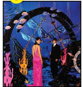
09H0 Sunken Treasures Theme